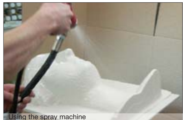
Using the spray machine